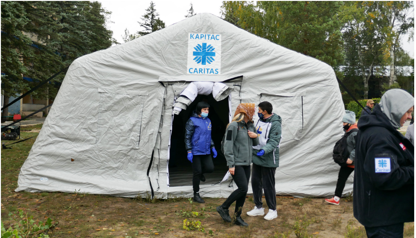
Caritas Ukraine teams conducted emergency simulations in October last year in preparation for a potential humanitarian crisis.

As reports emerge of families being displaced by the recent attacks in Ukraine, Catholic Relief Services is helping Caritas teams prepare to respond to urgent humanitarian needs across the country—including for evacuation, food and safe shelter—while taking every precaution to ensure the safety of their staff.