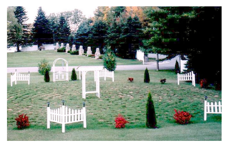
Labyrinth and Stations of the Cross

Contact us to díscuss your next retreat! P.O. Box 84 Conway, MI 49722-0084 231/347-3657 • augustínecenter@gmail.com