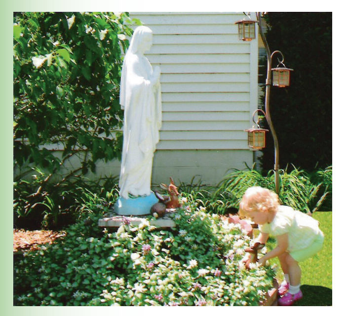
"I felt welcomed, cherished and loved by all the staff." - Sandra, at a group retreat