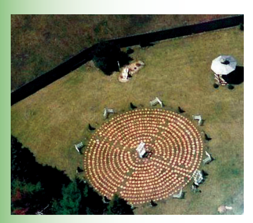
Labyrinth, gazebos and walking trails on 40 acres

The Augustine Center is an ecumenical facility, welcoming all faith traditions. A variety of groups come to the center for spiritual deepening, faith formation, planning, and community building. Please contact us to discuss options for hosting your group retreat.